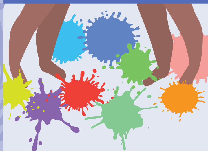
Messy Feet Sensory Play