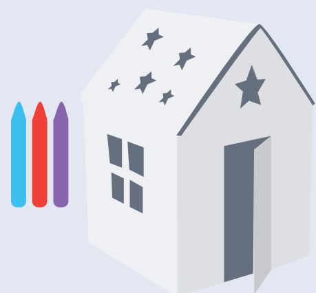
Colour in a Cardboard Cubby House