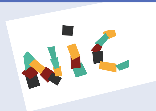
What's My Name Activity