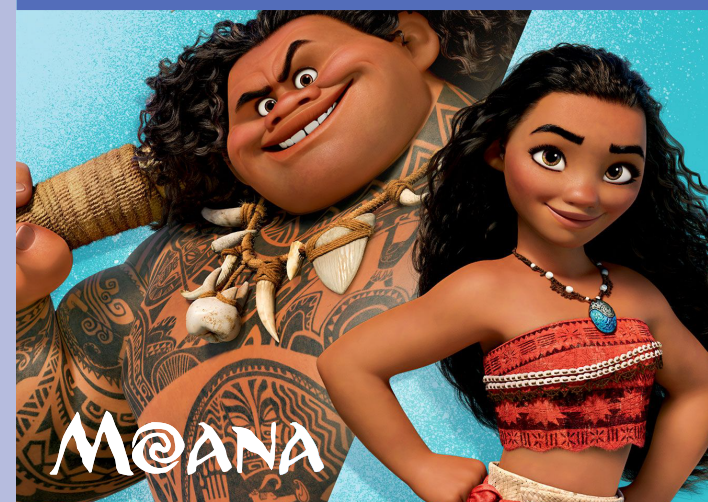
Movie Session - Moana