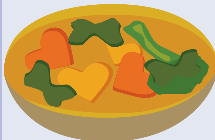
Cooking *colourful vegetable soup