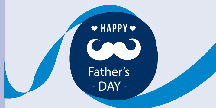
Father's Day Activity I love you this much